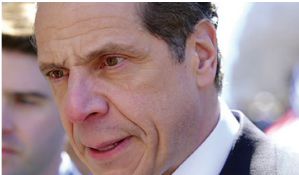
New York Governor Andrew Cuomo has remained silent on when the State will receive all of the money owed from the Seneca Nation.

As we have reported, the Senecas don't feel they have gotten the "exclusivity" bang for their more than $1 billion in bucks paid to the state since the compact began. They want a new deal and have balked at paying the state $255 million as ordered by the arbitration panel in April following the December decision favoring the state.